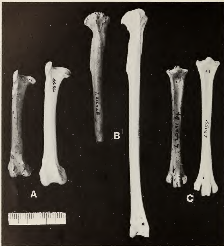
Fig. 4. Hindlimb elements of Geronticus apelex sp. nov., holotype, SAM-PQ-L20692 (on left in each pair) and G. eremita , MVZ 155199. A. Femora. B. Tibiotarsi. C. Tarsometatarsi. Scale is in mm.

As mentioned above, Pseudibis is very similar to, and possibly congeneric with, Geronticus . In the one poor skeleton of P. papillosa examined, the distal foramen of the tarsometatarsus was more proximally situated than in G. apelex or in any of the modern specimens of Geronticus .